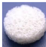
The synthetic matrix